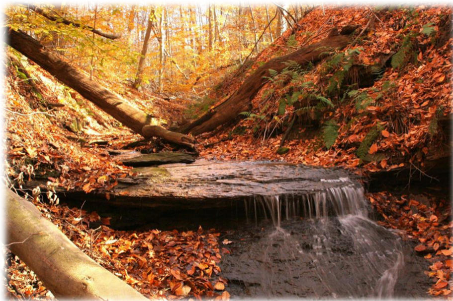
Little Sewickley Creek in Acorn Park.

These are not Western Pennsylvania's original Big and Little Sewickley creeks, nor were we the first Sewickley Township. The first Sewickley Township (1835) is in Westmoreland County through which the Sewickley creeks flow from Chestnut Ridge into the Youghiogheny River.