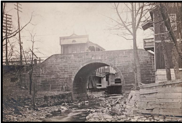
Kilbuck Run Bridge #1 was built in what later became Glenfield Borough and is shown in this 1907 photo.

This 1905 photo shows the Little Sewickley Creek Bridge #1 as it appeared before being widened in 1918. This Edgeworth bridge has carried traffic for 179 years.